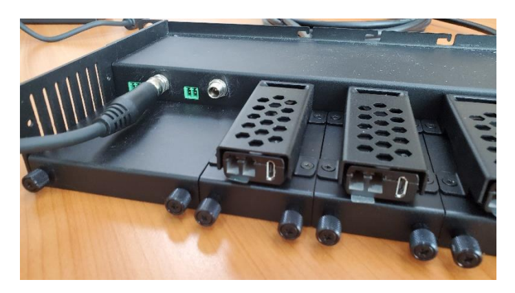
Fig. 6: Mounting the Module bracket on BR-500.

Mount the Module bracket on BR-500 and connect optical cable to each DisplayPort module.