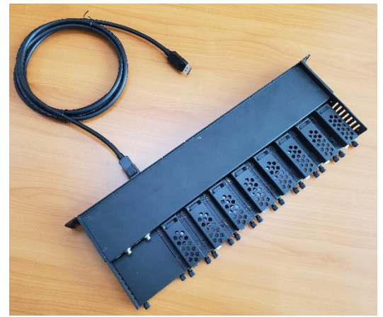
Fig. 7: BR-500 with copper cable connected

*Opticis has tested several trials with different copper cables including (Startech, Kramer, and Lindy-Anthra line). We recommend to use Display 1.2 copper cable up to 3 meters (9.84ft).