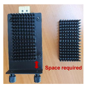
Fig. 5: Two(2) Heat sinks for each Module bracket

Stick the two (2) Heat sinks on the bottom of Module bracket. Make sure you align perfectly with the bottom screw holes so that it has enough space to be installed to BR-500.