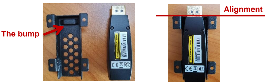
Fig. 2: Insert the push button into the bracket

Carefully place the push button of the DisplayPort module first to the bracket provided. The push button of the module MUST be pushed by the little bump of the bracket so that the latches can be crawled inside. Make sure that the top line of the housing is aligned with the bracket so that the head of the module can be perfectly fit in to the BR-500 port.