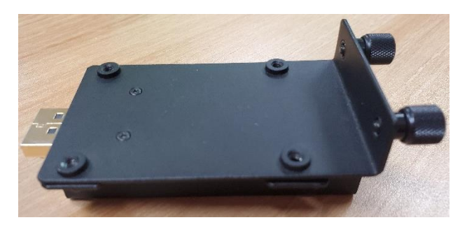
Fig. 3: Module inside the bracket and the slot, two screws are tightened.

Attach the slot on top to close the module inside the bracket. Make sure that the curved part at the bottom is directed upward as shown in Fig 3. Then insert the two screws that had been removed in "Step 2" back to the same place, passing through the slot.