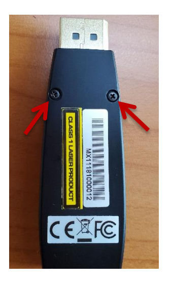
Fig. 1: Remove two screws on the back side of the DisplayPort module

Turn to the back side of the DisplayPort module and remove top two (2) screws.