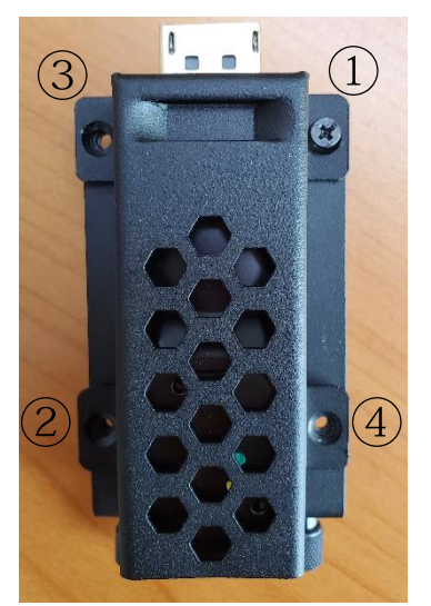
Fig. 4: Holes to insert the screws

Turn the bracket facing up, and tighten the rest screws (4) into the bracket.