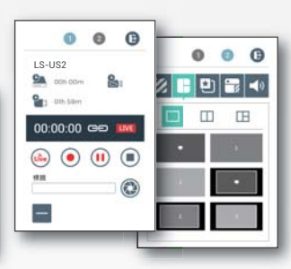
Mini Controller from Mobile Device