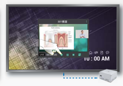
AREC Recording APK for Android Interactive Whiteboards