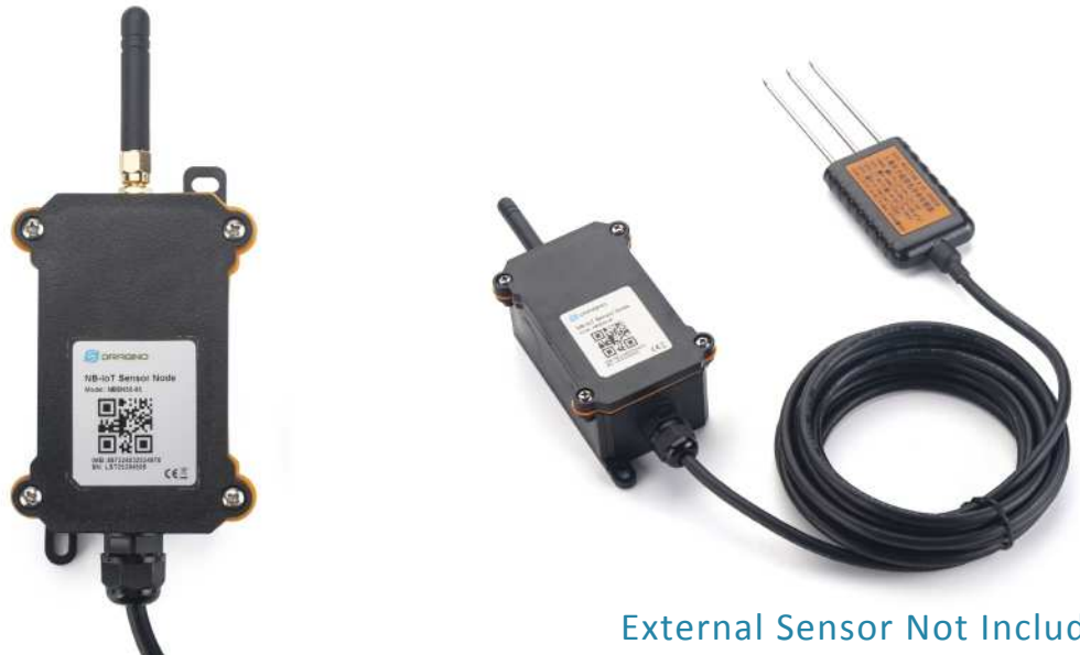
External Sensor Not Included