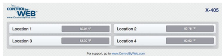
Example Control Page