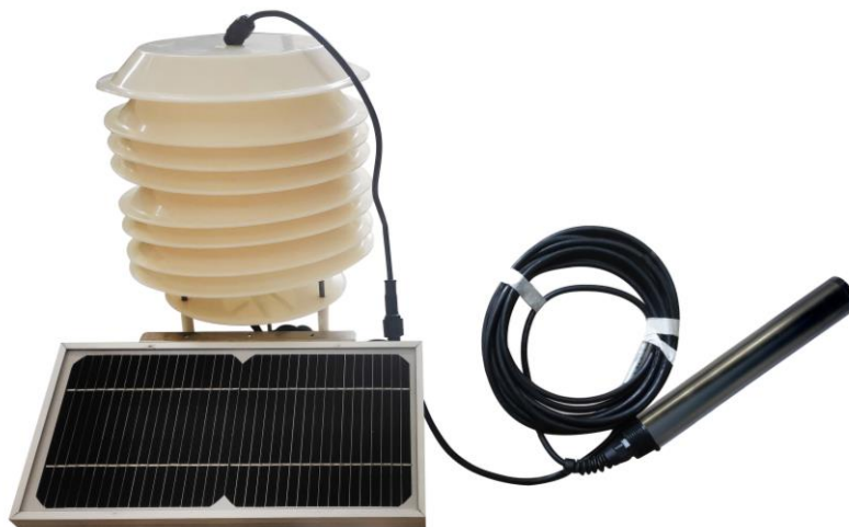
Fig. R72610 Appearance (subject to the actual object)