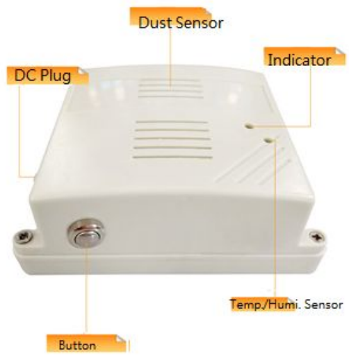
Figure 6 RA0716 internal dust and temperature and humidity Sensor (subject to the actual object)