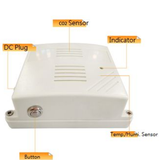
Figure 5 RA0715 is connected to CO2 and temperature and humidity Sensor (subject to the actual object)