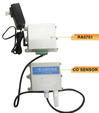
Figure 1 RA0701 renderings (subject to the actual object)