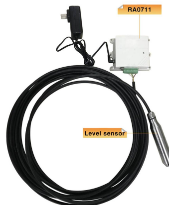
Figure2 RA0711 renderings (subject to the actual object)