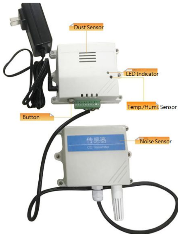
Figure 7 RA0723 internal dust and temperature and humidity sensor, external noise Sensor (subject to the actual object)