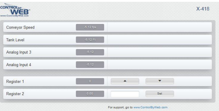
Example X-418 Control Page