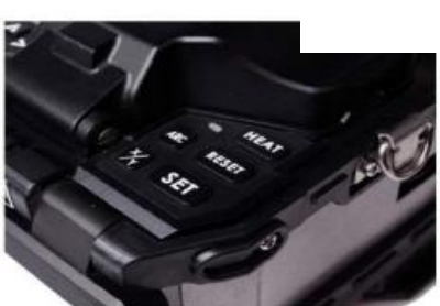
Anti-dust & waterproof buttons Abrasion-resistant coating