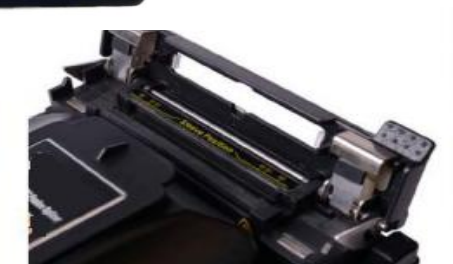
Automatic inductive heater Not heating without fiber