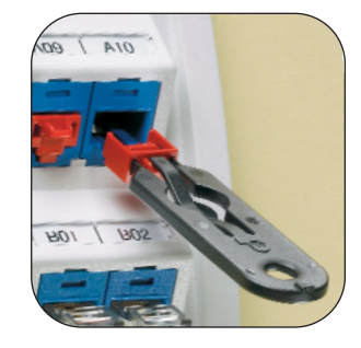
To remove: retract the device