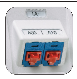
To install: snap the blockout device into the jack module