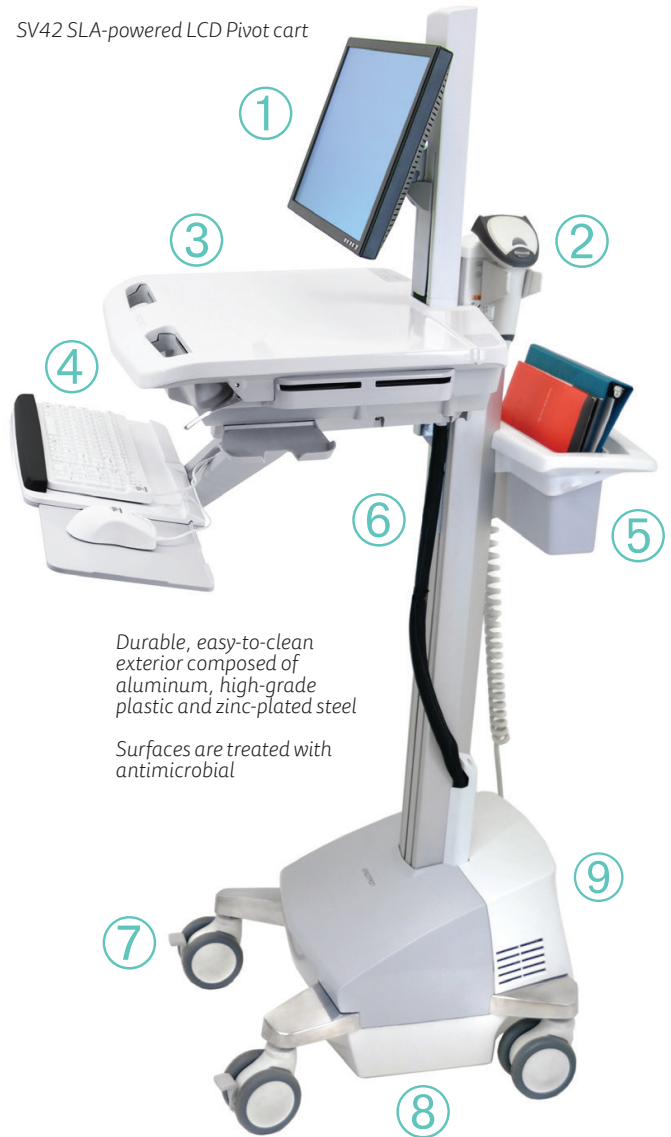
SV42 SLA-powered LCD Pivot cart

Durable, easy-to-clean exterior composed of aluminum, high-grade plastic and zinc-plated steel