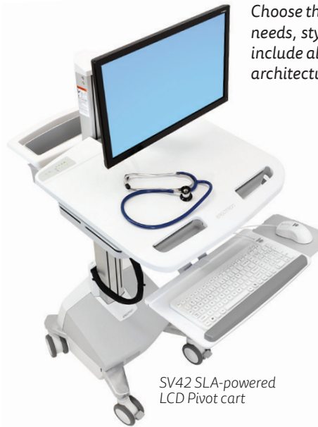
SV42 SLA-powered LCD Pivot cart

Choose the StyleView medical cart that best meets your caregiving needs, style and workflow. Our market-leading StyleView carts include all the features that caregivers ask for, with all the open architecture and quality construction that IT departments require.