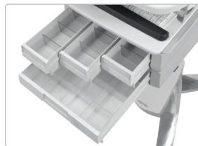
Several drawer configurations