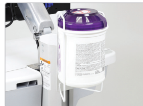
SV Sani-wipes Holder