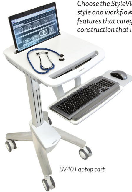
SV40 Laptop cart

Choose the StyleView medical cart that best meets your caregiving needs, style and workflow. Our market-leading StyleView carts include all the features that caregivers ask for, with all the open architecture and quality construction that IT departments require.