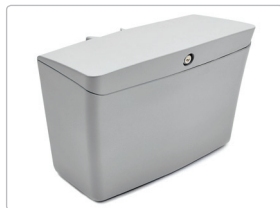
SV Storage Bin