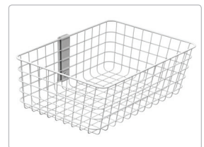
SV Wire Basket, Large

© 2019 Ergotron, Inc. 03/12/2019-EA Literature made in the U.S.A. Ergotron devices are not intended to cure, treat, mitigate or prevent any disease. StyleView is a registered trademark of Ergotron in the U.S.A. and China. Content is subject to change without notification.