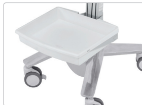
SV Front Tray