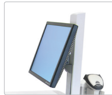
LCD Pivot: #SV40-6300-0