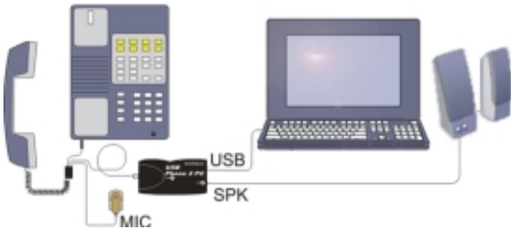
Phone 2 PC Interface