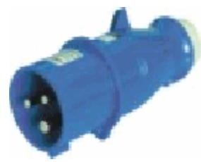
IEC60309 plug (32A 2P+E)