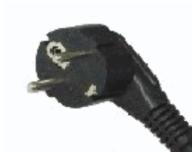
DIN49441 16A plug