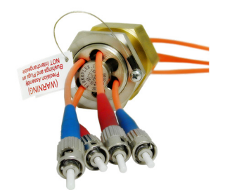
WGF-6 Shown with ST fiber installed